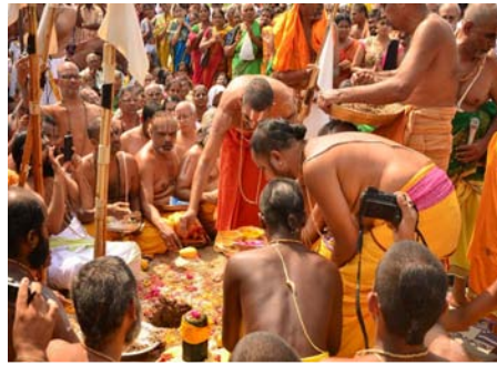
Foundation stone was laid by HH on auspicious Akshayathrithiya day on 2 nd May'14

As you know, the foundation stone was laid on 2 nd May 2014, on auspicious Akshayathrithiya day. Since then, different tasks have been taken to hand.